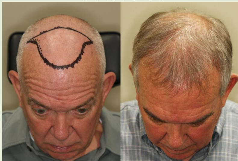
61 year old Male 10 month post procedure NeoGraft Hair Restoration